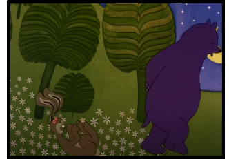
Starving Matthias ( Koplaló Mátyás )

2 In this Hungarian folk tale, which character rolls down from the attic and devours the entire village on its way? (Write your answer below! Answers in Hungarian are accepted.)