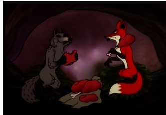
The Button and the Blackthorn ( A pityke és a kökény )