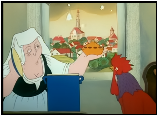
The Poor Man and His Horse ( Szegény ember meg a lova )

1 Match the images from Hungarian folk tales to their respective titles! (Connect them with lines!)