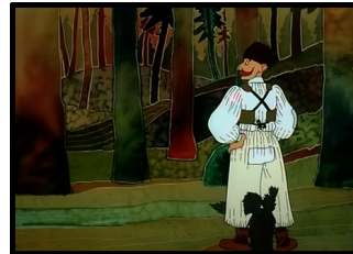
King Cat ( Kacor király )